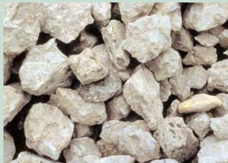
Recycled concrete aggregate can substitute for conventional aggregate in most applications.

The concrete industry also uses industrial byproducts such as fly ash (from coal combustion) and blast furnace slag (created in iron manufacture) to constitute a portion of the cement used in producing concrete. Use of such waste byproducts in concrete prevents 15 million metric tons a year of these waste materials from entering landfills. Utilizing these "supplemental cementitious materials" as a replacement for cement improves the strength and durability of concrete and also further reduces the CO 2 embodied in concrete by as much as 70% with typical values ranging from 15% to 40%.