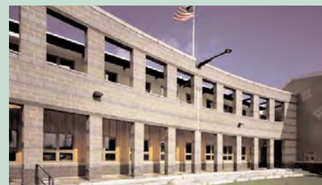
No other building material surpasses concrete's ability to withstand cataclysmic forces such as hurricanes, tornados and explosions.

Concrete's legendary strength also enables it to withstand most man-made and natural disasters, including fires, hurricanes, earthquakes, tornados, explosions and even tidal waves. There is no stronger testament to the sustainability of concrete buildings than when they are the only ones still standing.