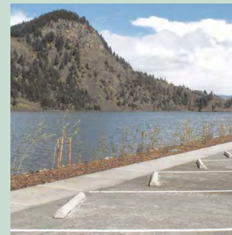
Pervious concrete filters water through a permeable subbase and the soil below, preventing contaminated water from entering waterways or stormwater management systems.

Pervious concrete is made with little or no sand, producing a strong and durable pavement with voids that allow rain water to pass through. Pervious concrete pavements reduce or eliminate runoff and support pollution mitigation by capturing the first flush of rainfall and allowing it to percolate into the ground. Soil chemistry and biology can then "treat" the polluted water naturally. Pervious pavements reduce runoff that would otherwise burden streams with warm polluted water and instead help replenish aquifers. This approach also reduces or eliminates the need for stormwater detention ponds with corresponding energy reductions and cost savings for the developer as well as the opportunity to make use of that otherwise unproductive land.