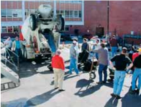
State highway engineers at the annual National Highway Institute course line up to test concrete