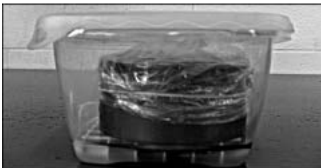
Fig 3 Sorptivity test (ASTM C 1585) set up

Mixture BR-3 had the same w/cm (0.39) as mixture BR-1 but had a much lower total cementitious content [356 kg/m 3 (600 lb/yd 3 ) as opposed to 418 kg/m 3 (705 lb/yd 3 )]. This