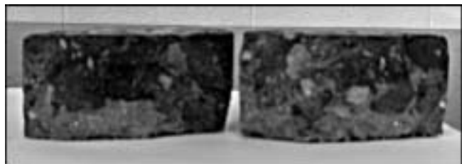
Fig 2 Rapid migration test (AASHTO TP 64) showing chloride penetration depths

The bulk diffusion test, ASTM C 1556, is a new test standardised in 2003 14 . In this test, after 28 days of moist curing the top 76 mm (3 in) of the concrete cylinders are cut, sealed (except for the finished surface) and vacuum saturated in saturated calcium hydroxide solution. The saturated test specimen is immersed in a sodium chloride solution with one unsealed face exposed to the solution until the specimens attained an age of about 180 days. The specimen is then removed and ground in 2 mm thick layers from the exposed surface. The acid soluble (total) chloride content is measured